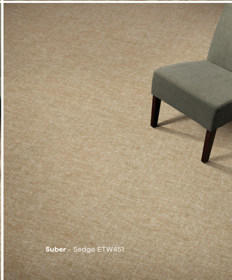
Suber - Sedge ETW451