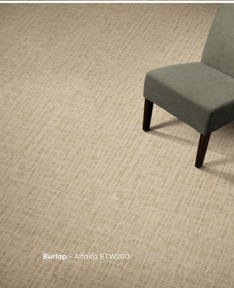
Burlap - Alfalfa ETW200