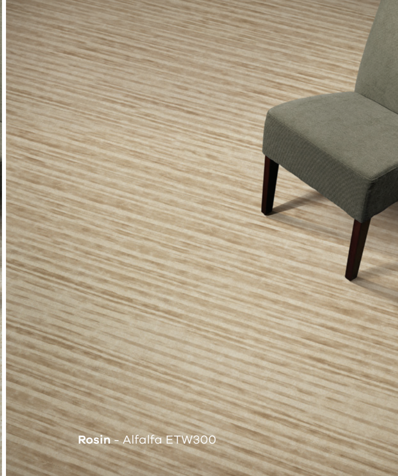
Rosin - Alfalfa ETW300