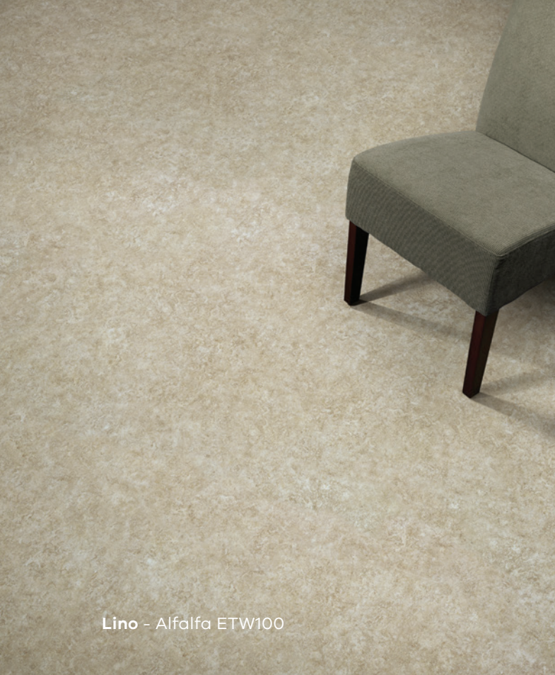
Lino - Alfalfa ETW100