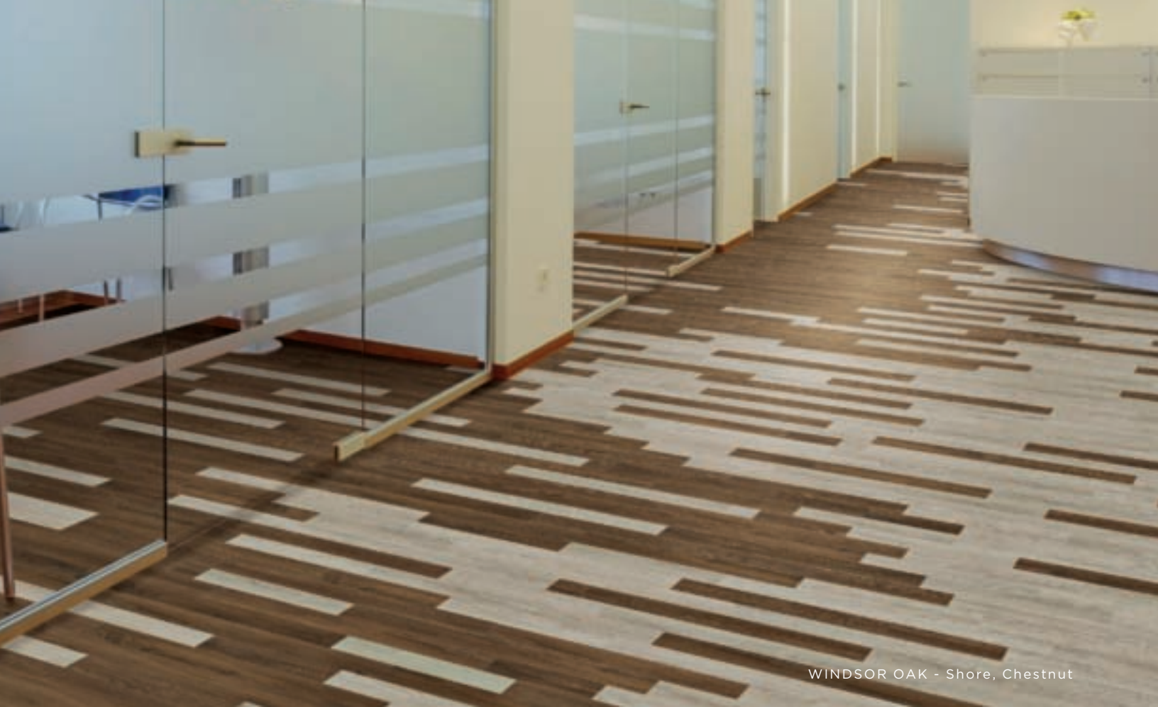
WINDSOR OAK - Shore, Chestnut