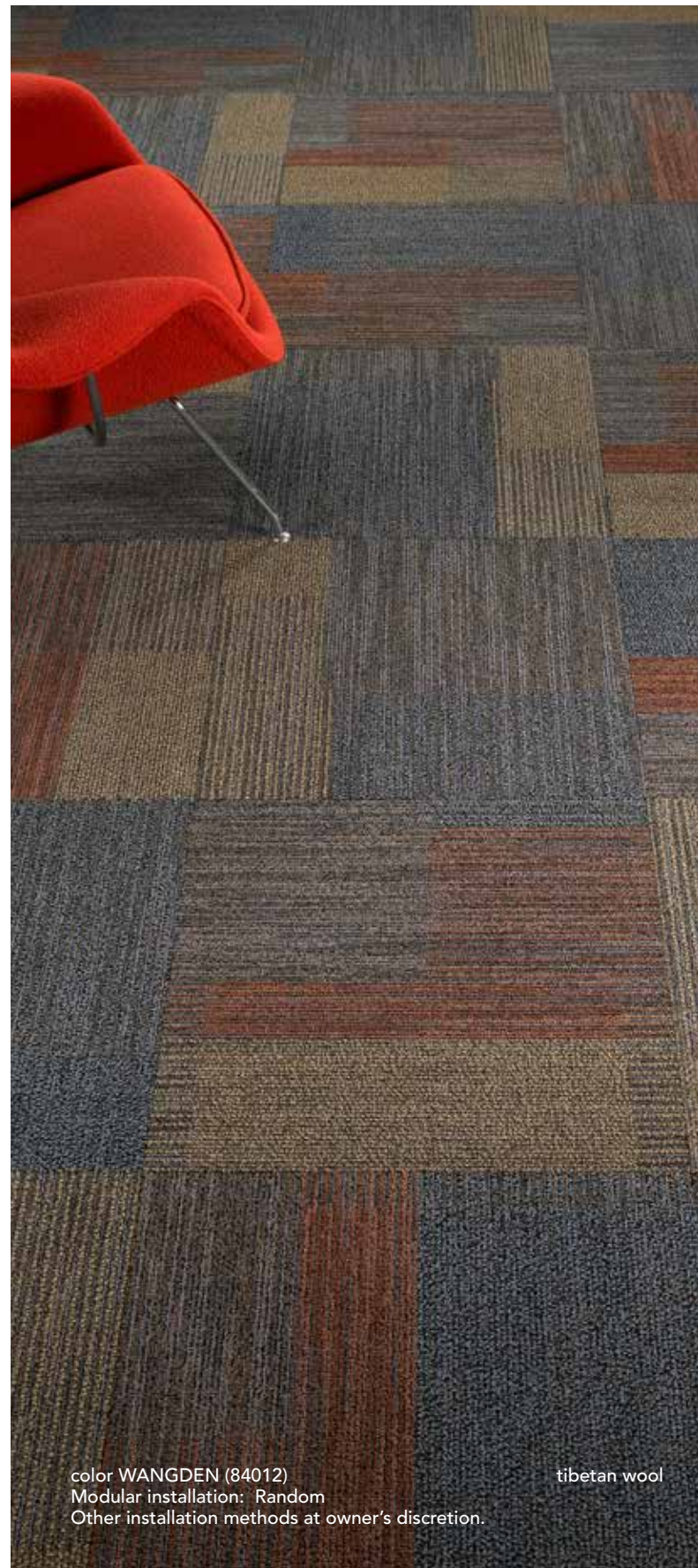
color WANGDEN (84012) Modular installation: Random Other installation methods at owner's discretion.