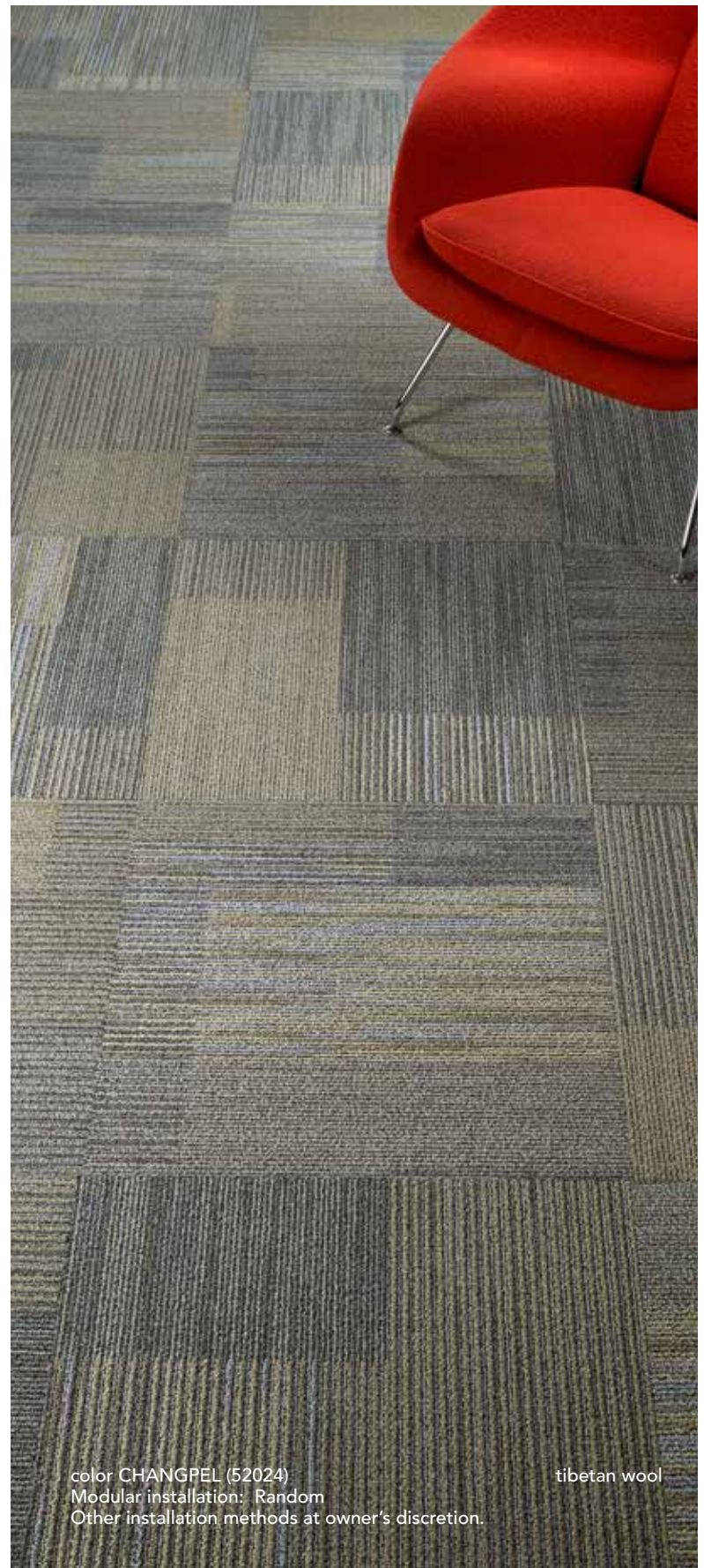
color CHANGPEL (52024) Modular installation: Random Other installation methods at owner's discretion.