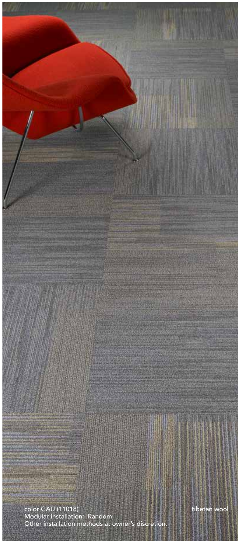
color GAU (11018) Modular installation: Random Other installation methods at owner's discretion.