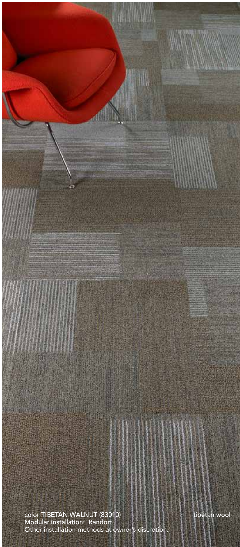
color TIBETAN WALNUT (83010) Modular installation: Random Other installation methods at owner's discretion.