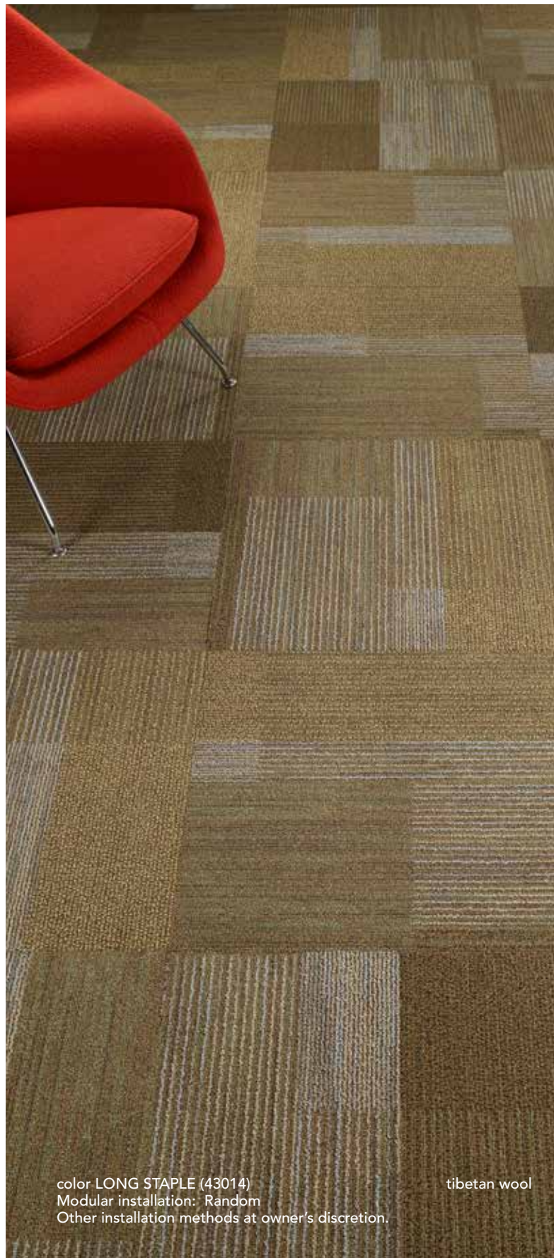
color LONG STAPLE (43014) Modular installation: Random Other installation methods at owner's discretion.