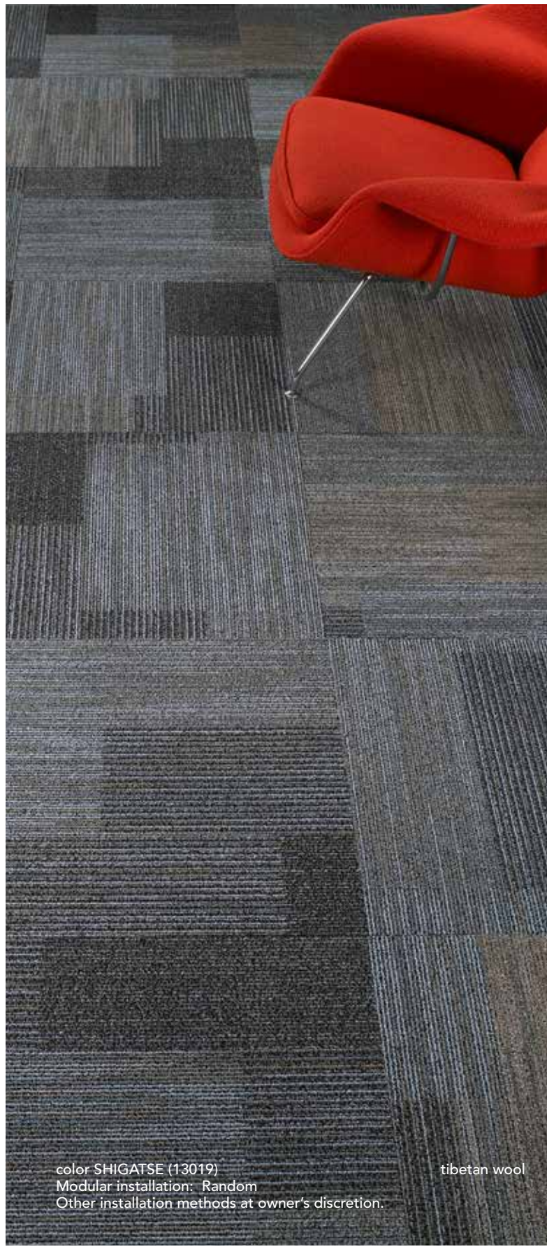
color SHIGATSE (13019) Modular installation: Random Other installation methods at owner's discretion.