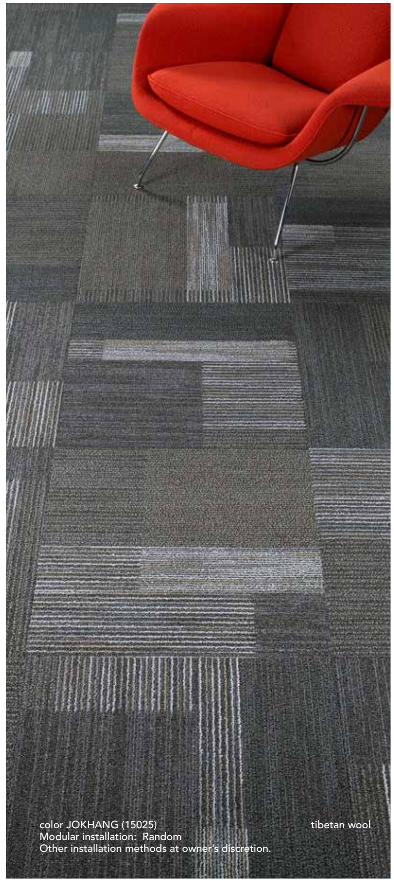
color JOKHANG (15025) Modular installation: Random Other installation methods at owner's discretion.