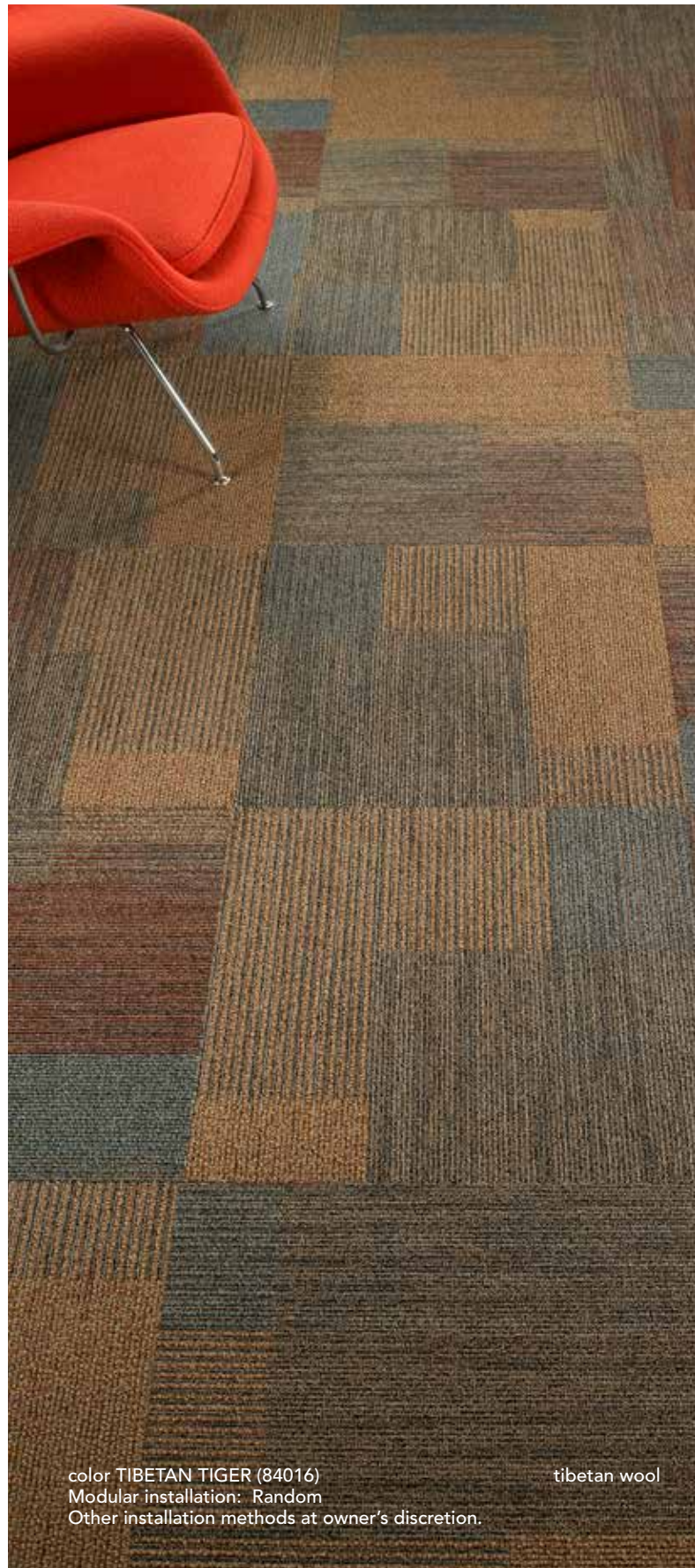
color TIBETAN TIGER (84016) Modular installation: Random Other installation methods at owner's discretion.