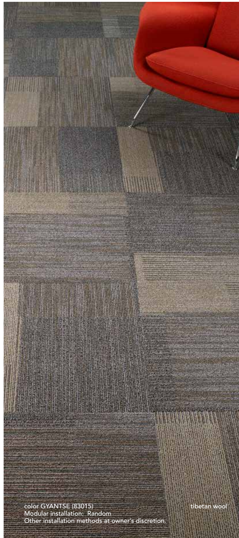
color GYANTSE (83015) Modular installation: Random Other installation methods at owner's discretion.