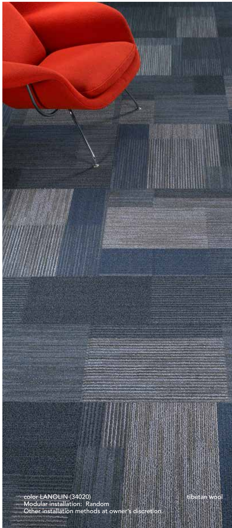
color LANOLIN (34020) Modular installation: Random Other installation methods at owner's discretion.