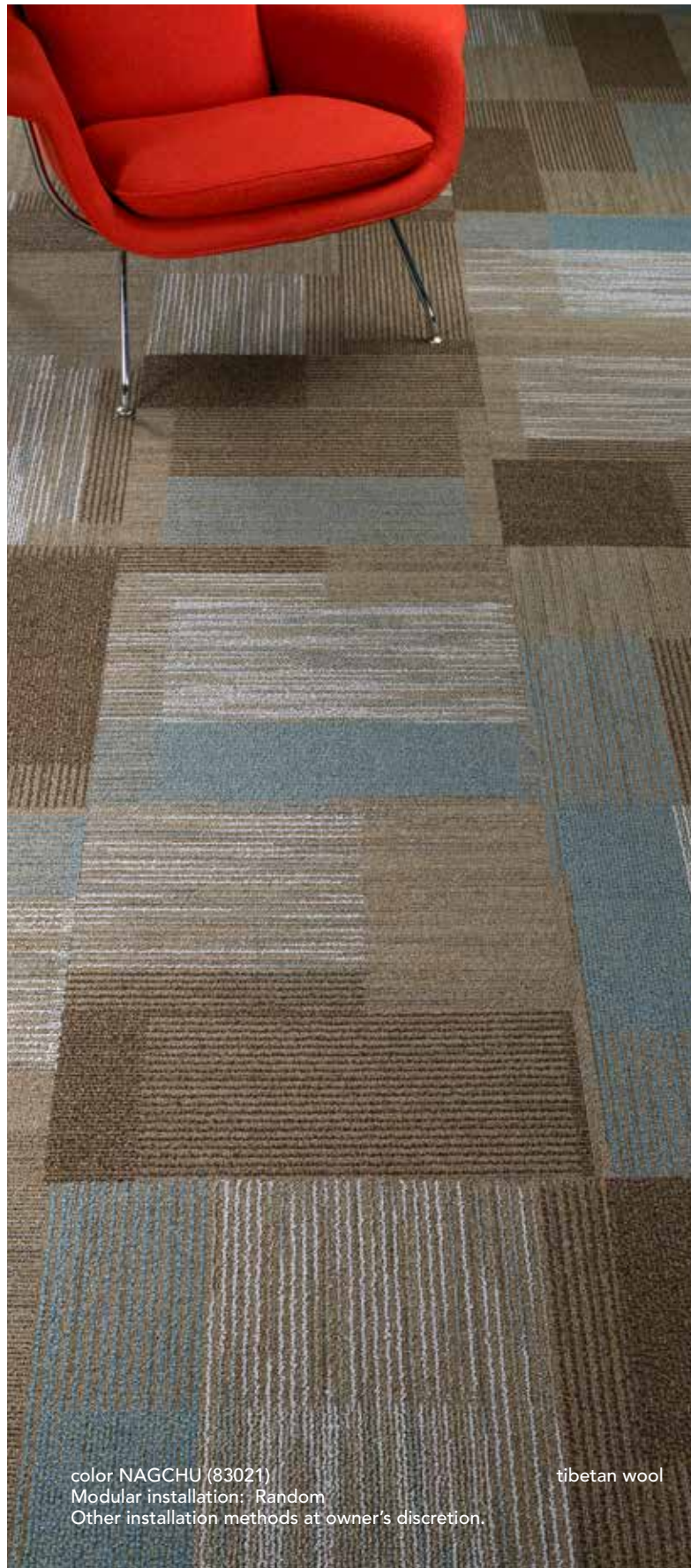
color NAGCHU (83021) Modular installation: Random Other installation methods at owner's discretion.