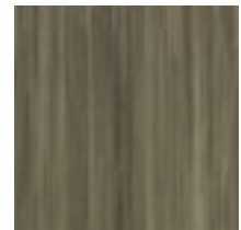
VIA CAMINO 12348 - 18" x 18" 12349 - 4" x 36"