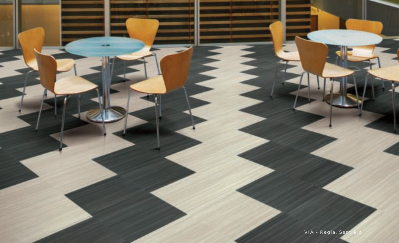
VIA - Regia, Sentiero