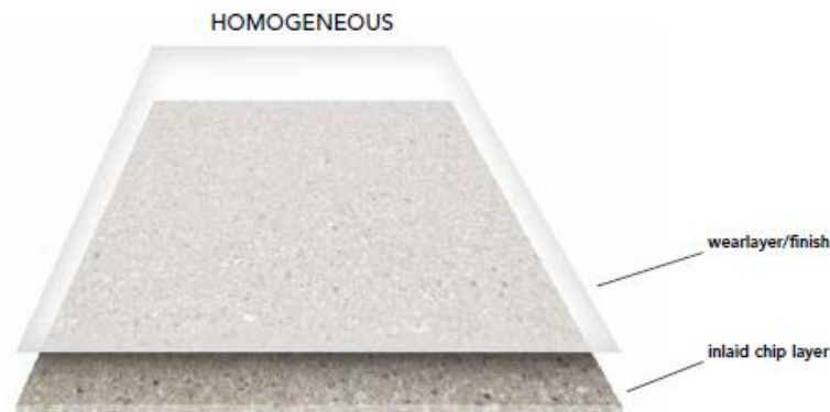
Figure 1: Diagram of homogeneous vinyl flooring cross section

The manufacturing process results in a single layer product although a decorative application and high-performance coating can be applied to the surface. A diagram of a homogenous vinyl flooring cross-section is shown in Figure 1.