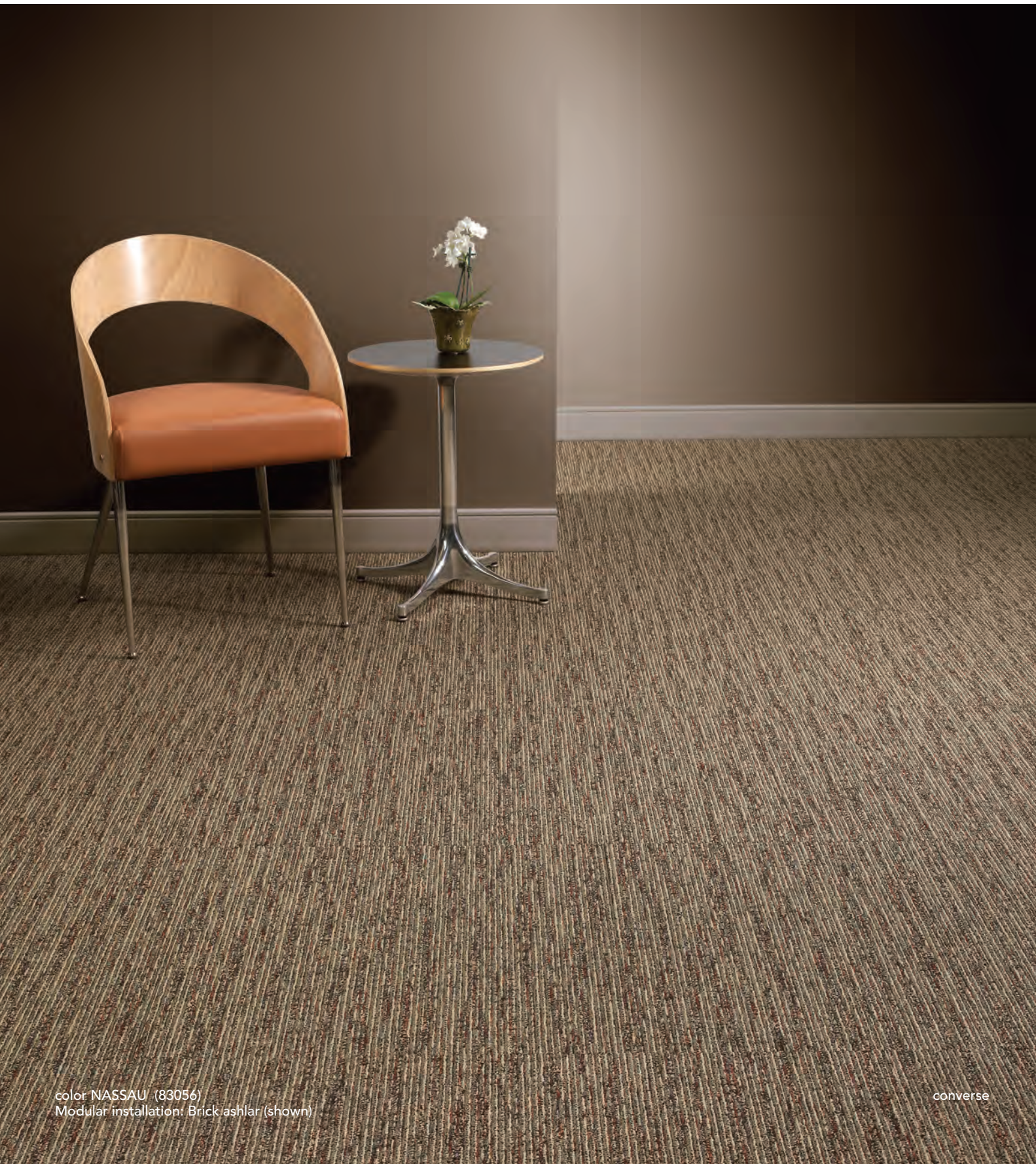
color NASSAU (83056) Modular installation: Brick ashlar (shown)