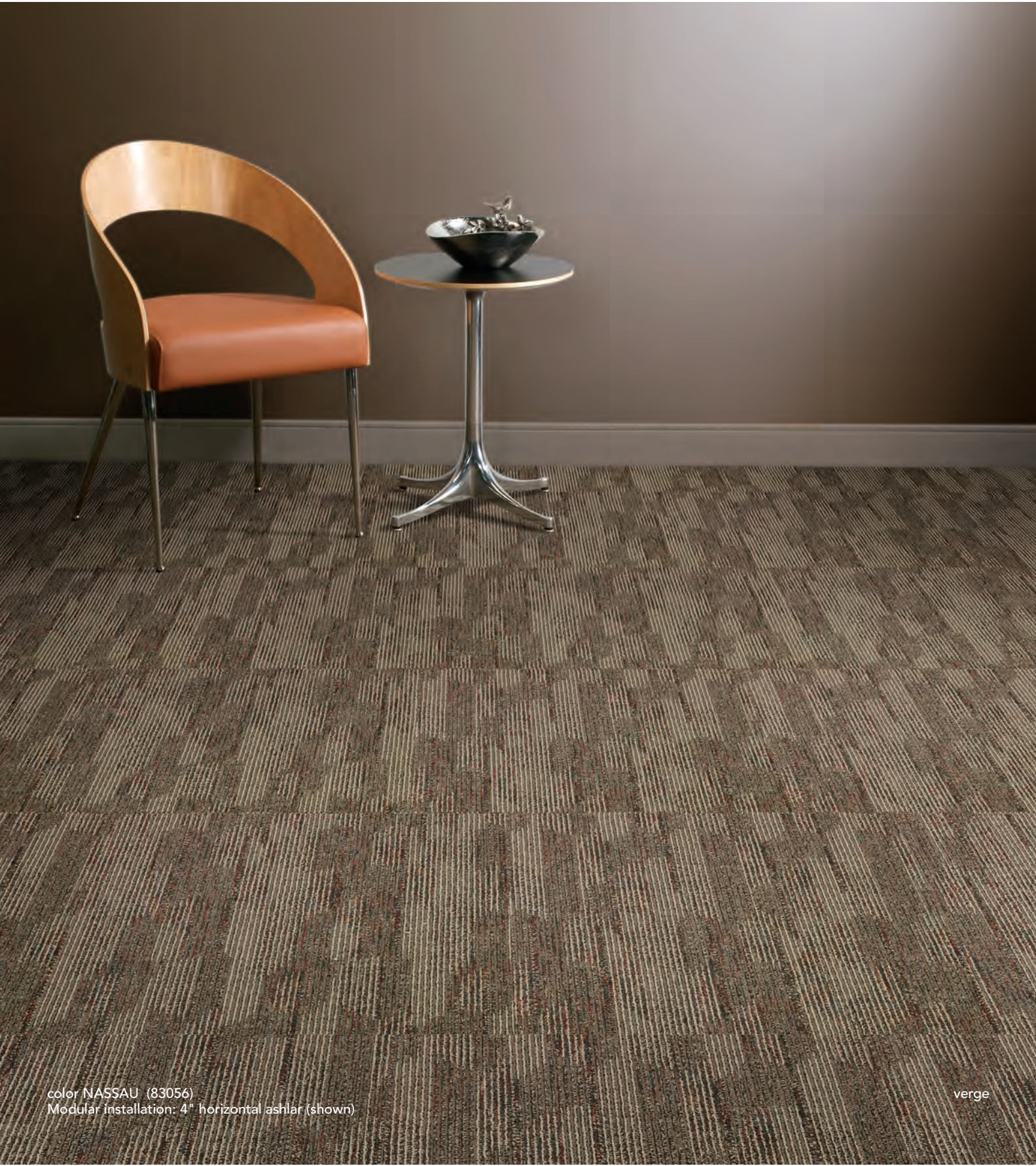
color NASSAU (83056) Modular installation: 4" horizontal ashlar (shown)