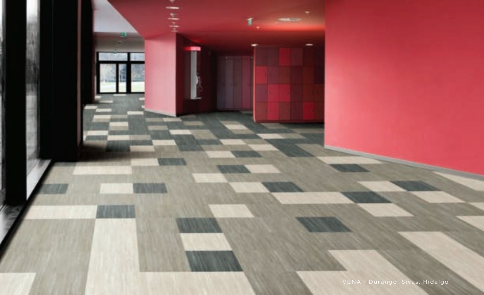
VENA - Durango, Sivas, Hidalgo