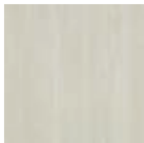
VENA SIENA 12370 - 18" x 18" 12371 - 18" x 36"

Collection: Nature's Paths Tile Construction: Luxury Vinyl Tile Size: 18" x 18", 18" x 36" Profile: Micro Beveled Edges Overall Thickness: 0.100" (2.5 mm)