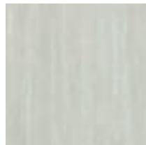
VENA DURANGO 12366 - 18" x 18" 12367 - 18" x 36"