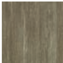
VENA KONYA 12364 - 18" x 18" 12365 - 18" x 36"