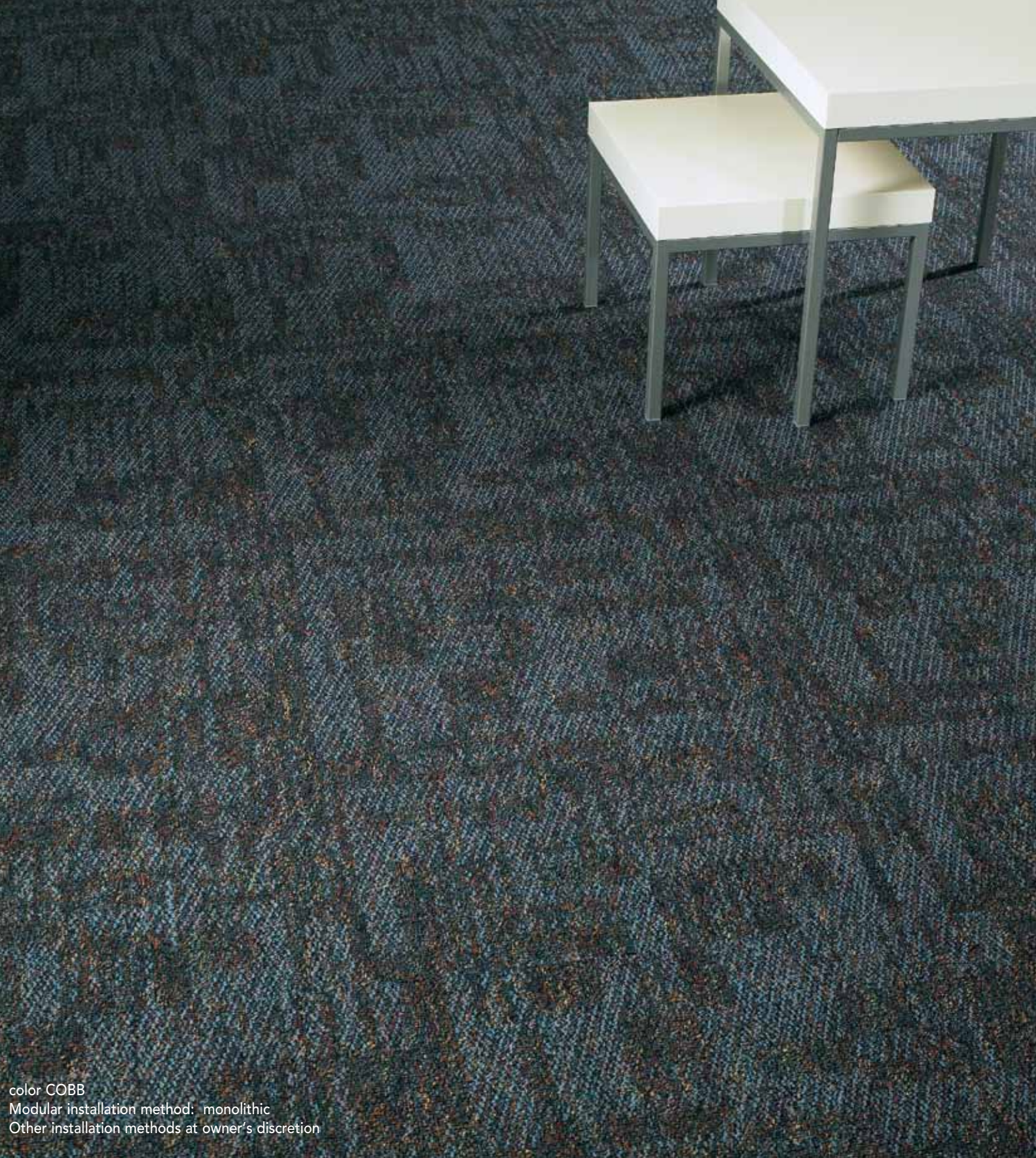
color COBB Modular installation method: monolithic Other installation methods at owner's discretion