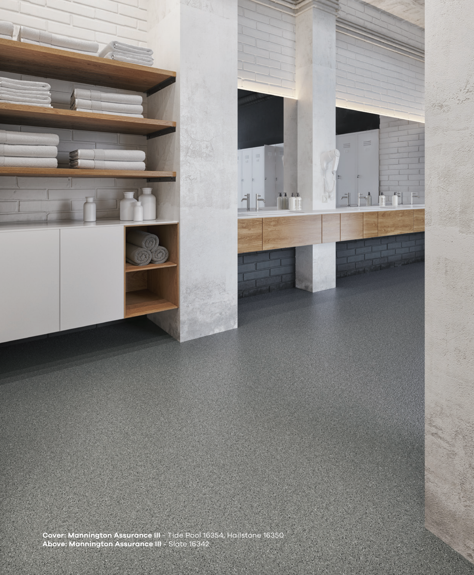
Cover: Mannington Assurance III - Tide Pool 16354, Hailstone 16350 Above: Mannington Assurance III - Slate 16342